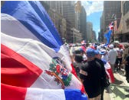
Dominican- New Yorkers

Ydanis Rodriguez, actual New York City Transportation Commissioner and Dario's mentor, promoter and protector