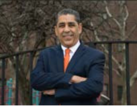
US Representative Adriano Espaillat